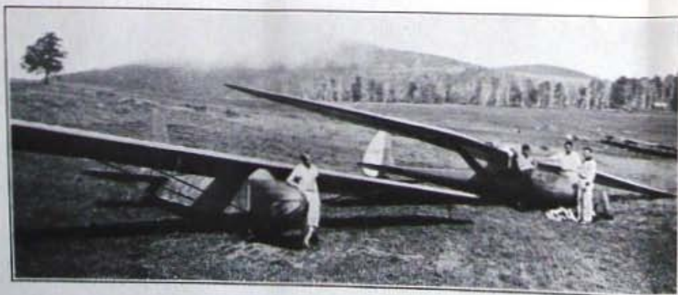
The site at Big Meadows, Shenandoah National Park.

At about 3,000 feet I began making smaller circles, and found it considerably easier to stay in the thermal. At 4,000 feet I climbed right through the middle of the group of four that I had been following. They were flying in all sorts of odd directions that seemed to indicate that they knew something was there, but couldn't locate it. I suspect that they were watching their instruments and didn't see me. Merboth did see me, and we kept together until about 5,000 feet. At that point he appeared to find something else off to one side, but it petered out, and I went into a small cloud about 200 feet above him. The cloud appeared to be disintegrating before I went in, but I climbed to